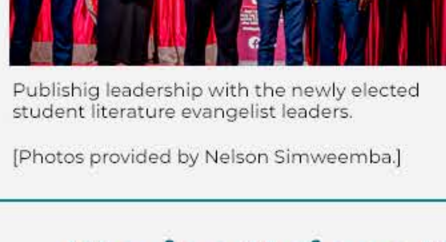
Publishing leadership with the newly elected student literature evangelist leaders.

The recruits come from various university departments, with the majority from the School of Theology, followed by the School of Health Sciences.