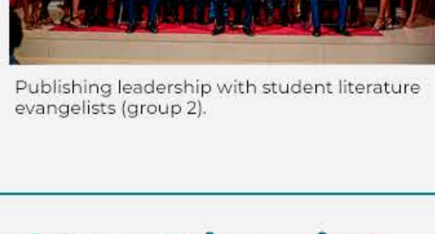
Publishing leadership with student literature evangelists (group 2).