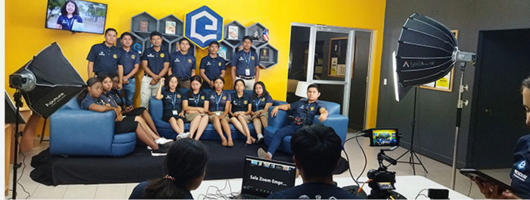
Student Literature Evangelists from Montemorelos University, Inter American Division